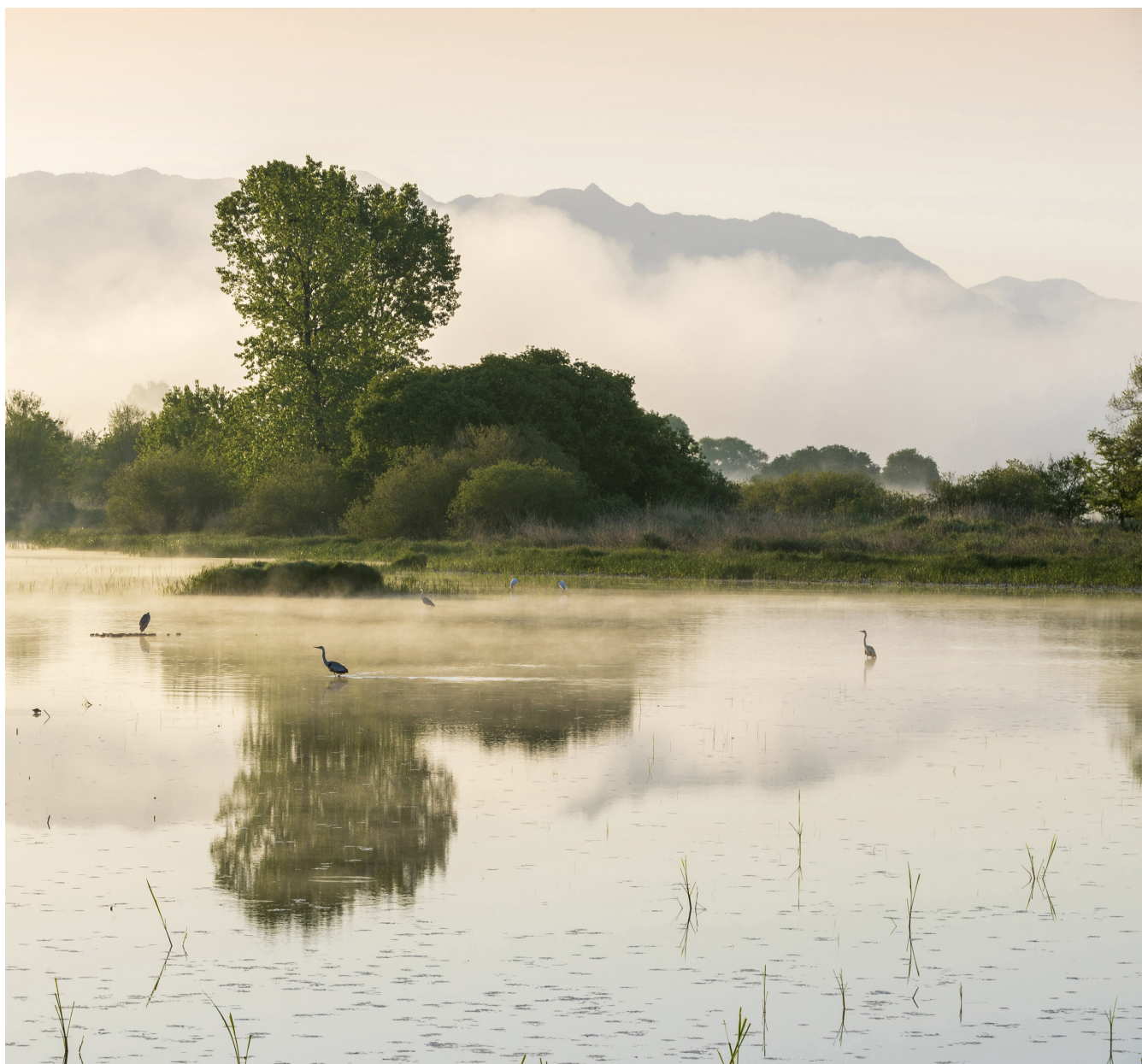
Misty morning at the Upo Wetland near Changnyeong-gun, South Korea.