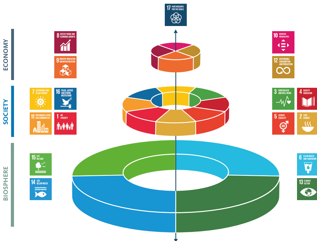
Figure 3.2. The SDG ‘wedding cake’.

Prior to the SDGs materializing in 2015, ‘mainstreaming’ was adopted internationally as a key approach to integrate the environmental issues raised in MEAs into national plans and strategies, as well as in sectoral plans and policies (Nunan et al. 2012). Particularly significant was the Poverty Reduction Strategy Paper (PRSP) initiative launched by the Bretton-Woods Institutions in 1999. The message of PRSP was further reinforced through the establishment of the Millennium Development Goals (MDGs) in 2000. For many years, the MDGs were considered to be the main entry point for mainstreaming MEA objectives at the national level, particularly in low-income countries. However, evidence