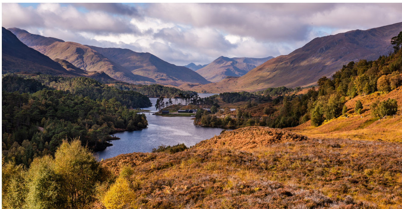
Starting 2023, the Affric Highlands rewilding project, Scotland, will return 500,000 acres of land to natural processes.

committed to individual and legally binding targets for GHG emissions. Article 12 defines a CDM whereby high-income countries (Annex 1 countries) earn certified emission reductions through projects implemented in low-income countries. A CDM project activity might involve, for example, a rural electrification project using solar panels or the installation of more energy-efficient boilers. However, several issues, including high transaction costs, have surrounded CDMs, which has resulted in a weak project pipeline (Cowie et al. 2007; FAO and UNCCD 2015). However, since CDMs are not an instrument under the Paris Agreement, the mechanism is currently phased out, which means that selling credits from CDM projects in the market beyond 2021 is unlikely. Instead, a new central mechanism will take its place under Article 6.4 of the Paris Agreement once its rules and regulations have been adopted. Some projects, such as Land-Use Change and Forestry (LULUCF) can also access funding through Reducing Emissions from Deforestation and forest Degradation in developing countries (REDD+) (see Chapter 6).