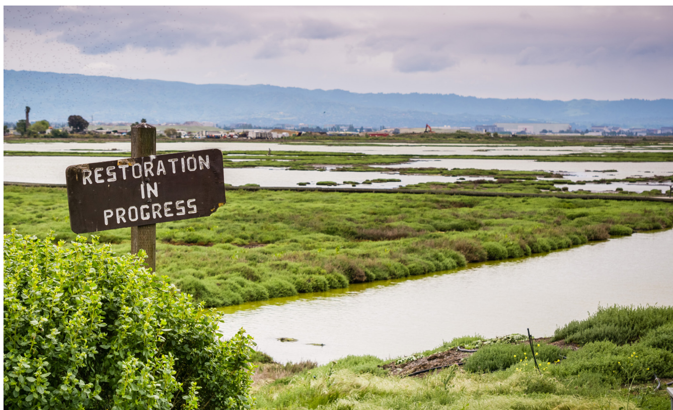
Restoration of the Alviso wetlands at the Don Edwards wildlife refuge, California.

Unlike climate, biodiversity, and land, water has not been governed in the same globally coordinated manner and there is no 'Rio Convention' or other overarching global framework for water. This has implications for both policy coordination as well as access to financing, especially in the context of climate change mitigation.