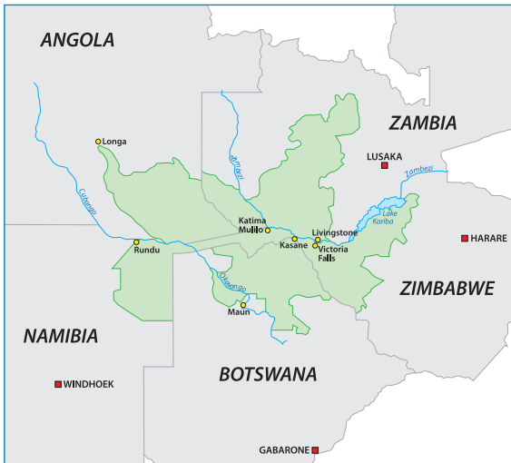
Kavango-Zambezi Transfrontier Conservation Area (KAZA) and Victoria Falls (from Zambia looking into Zimbabwe).

VOICE FROM A CO-CONVENOR: 'KAZA is the largest terrestrial Transfrontier Conservation Area (TFCA) in the world (520,000 km 2 – the size of Germany and Austria combined), shared by five southern African countries (Angola, Botswana, Namibia, Zambia, and Zimbabwe). It is immensely rich in natural resources, biodiversity, and vast landscapes. With more than 70% of the landscape under conservation, KAZA is an eminent example of concerted transboundary cooperation on natural resource management and socio-economic development. As KAZA's biodiversity, livelihoods, and economic development are intricately tied to water resources, partnerships and strategic directions are being explored to enhance water security around the landscape's two major river basins – the Okavango and Zambezi. The session will showcase innovative partnerships for advancing transboundary cooperation around water resources for conservation and economic development at multiple scales through leveraging research and outreach.' Kule Chitepo, Chief Partnership Advisor and Contractor for the USAID Resilient Waters Program.