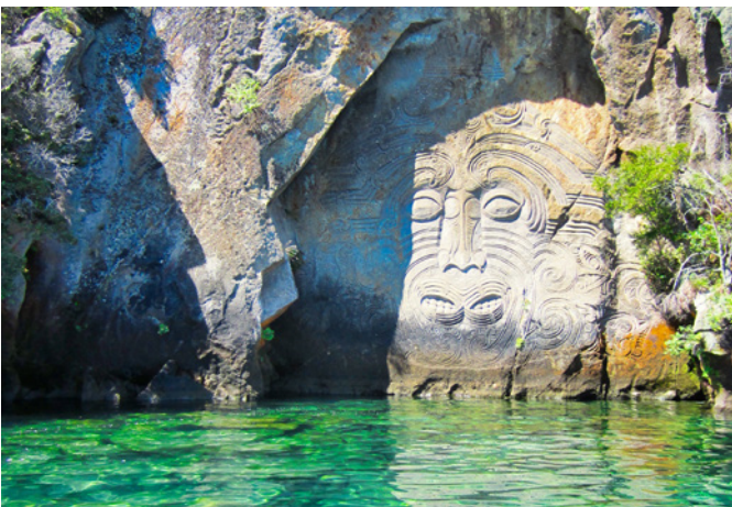
Maori rock carvings at Lake Taupo, New Zealand.