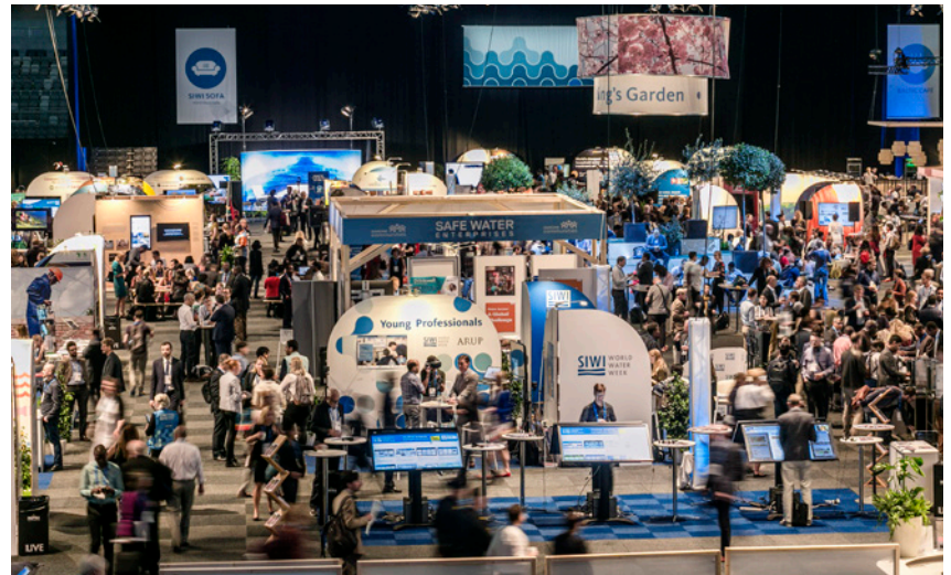
Images from World Water Week 2021.