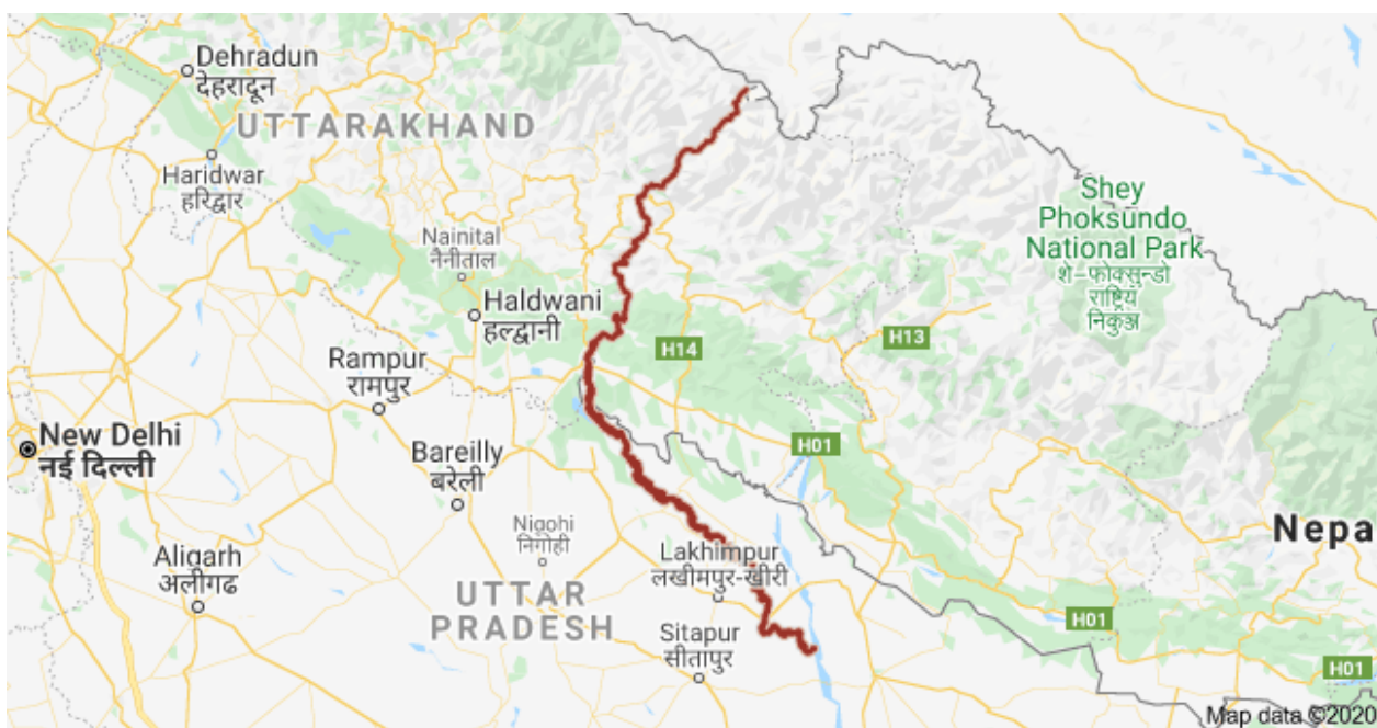
Figure 1. Map of the Mahakali–Sharda River. From Google Maps https://bit.ly/3eLU9cm .

The perennial river forms part of the world's tallest mountain range and like many others in the area it has vast potential for the development of 'clean' (climate-friendly) and renewable hydropower. The steep gradient of the topography provides ideal conditions for generation of electricity at affordable cost, seen as an essential prereq-