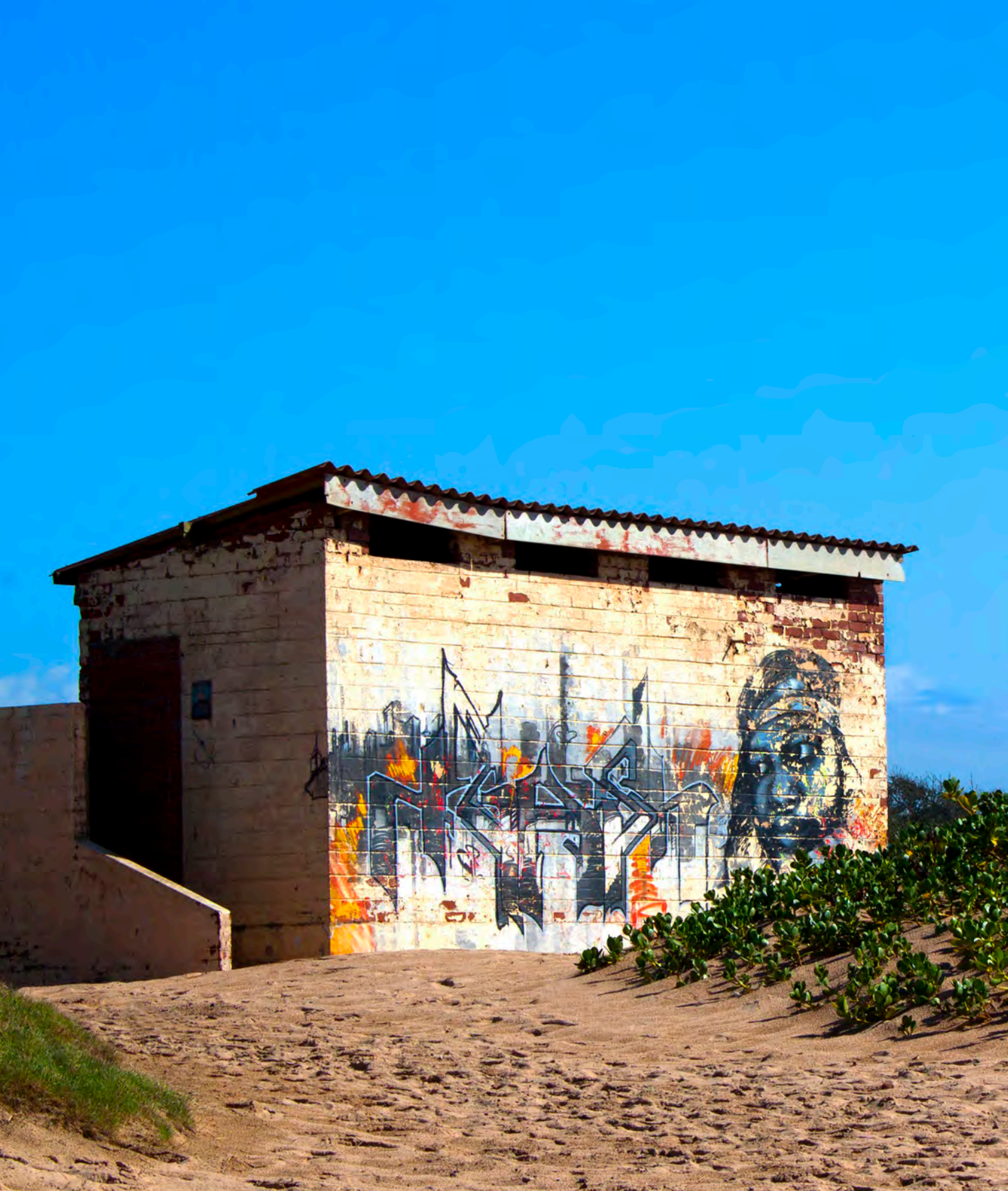
In eThekweni, sanitation is seen as both a public health issue and key to successful water conservation. eThekweni Water & Sanitation won the 2014 Stockholm Industry Water Award for its transformative and inclusive approach to providing water and sanitation services.