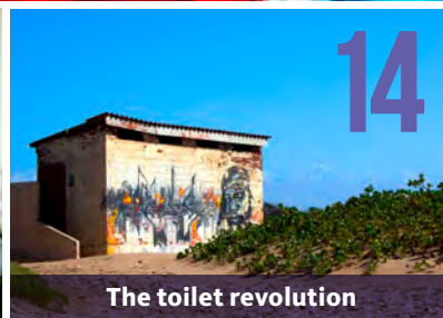
14 The toilet revolution