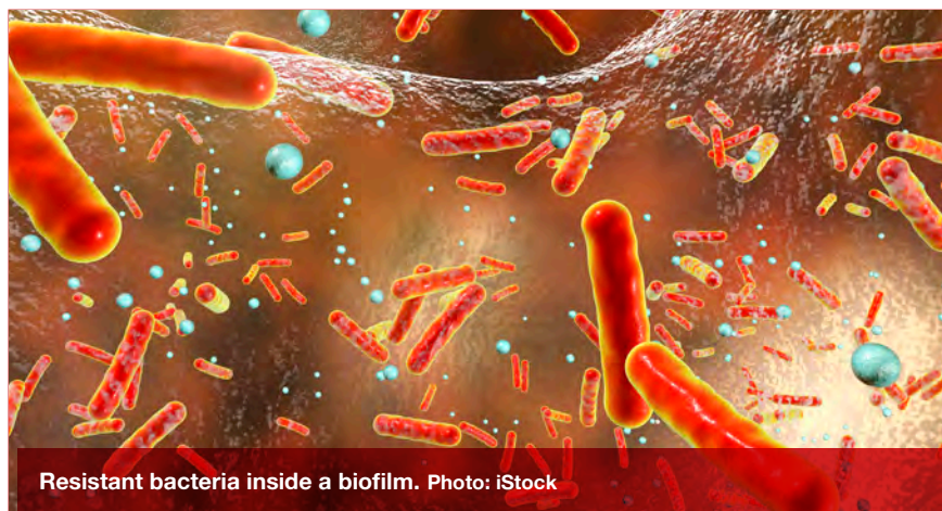
Resistant bacteria inside a biofilm.

Local groups, quoted in two Nordea-funded studies, complain that the growing body of academic and NGO reports about the dangers of water pollution in Hyderabad are not taken seriously enough. Companies continue to discharge insufficiently treated wastewater into the area's waterways without the authorities being able to handle the situation. Activists fear that the situation could get even worse as India is seeking to further expand the national pharmaceutical industry, which is already one of the fastest growing segments of the Indian economy, employing 2.5 million people.