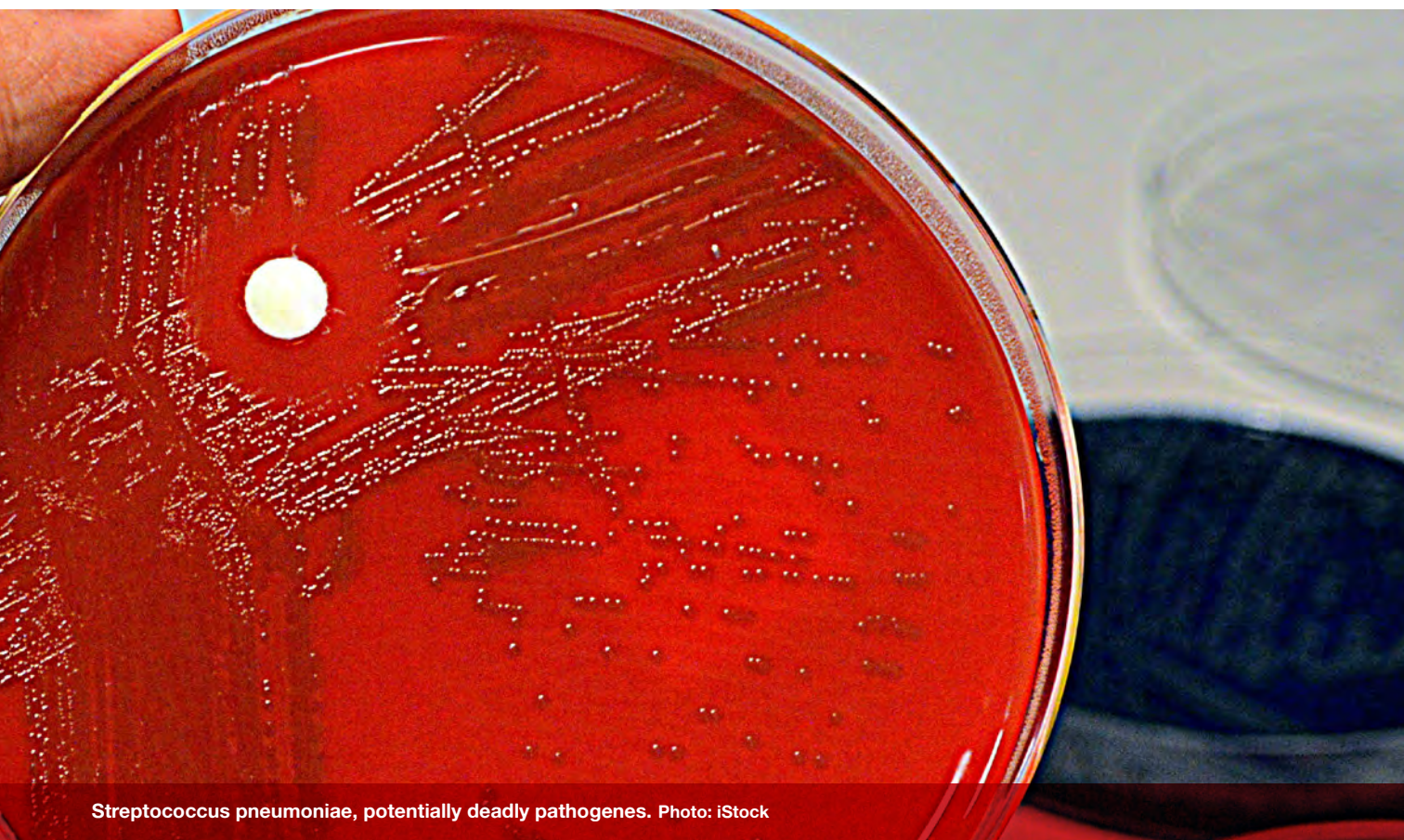
Streptococcus pneumoniae, potentially deadly pathogens.

begin to feel the pressure and see the advantages of developing and implementing stronger risk management strategies to prevent antibiotic discharge in the environment” he says.