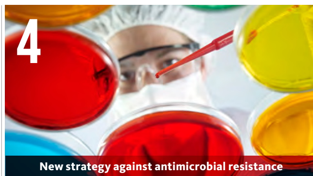
4 New strategy against antimicrobial resistance