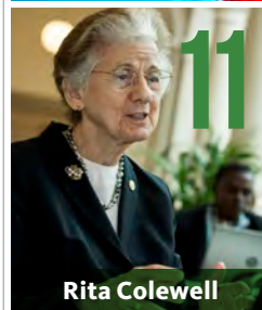
11 Rita Colwell