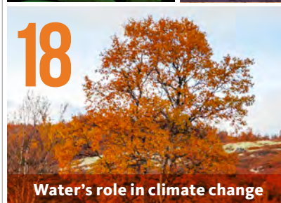
18 Water's role in climate change