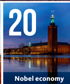
20 Nobel economy