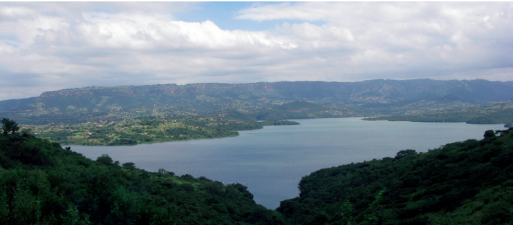
River Basin South Africa.

The approach followed by the teams in the process of developing the different NAPAs is guided by some basic principles, including that the process 'should have a country-driven approach and be a participatory process involving multi-stakeholder consultation, reflecting a true bottom-up approach'. In addition, the process should involve a multidisciplinary group of experts, and undertake comprehensive and integrated assessments and it should