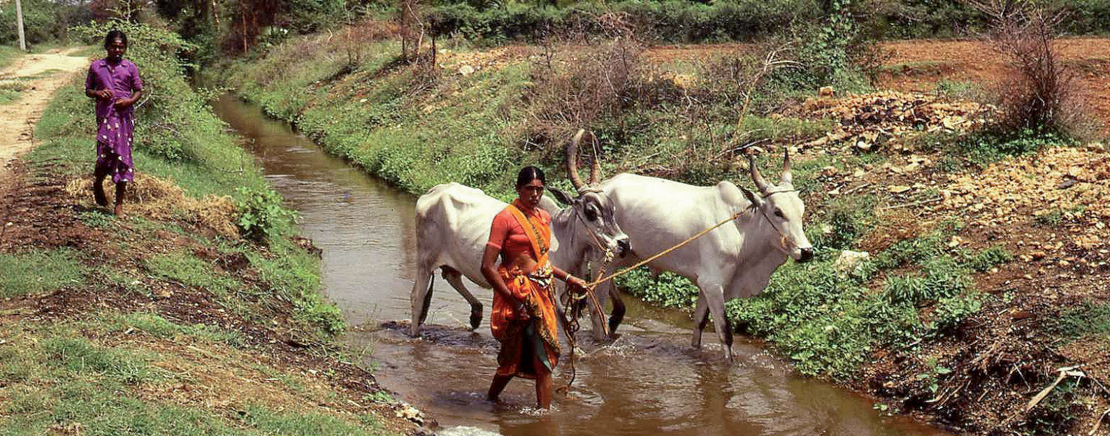
Steadily growing in population, the state of Tamil Nadu in India faces growing shortages of potable water.