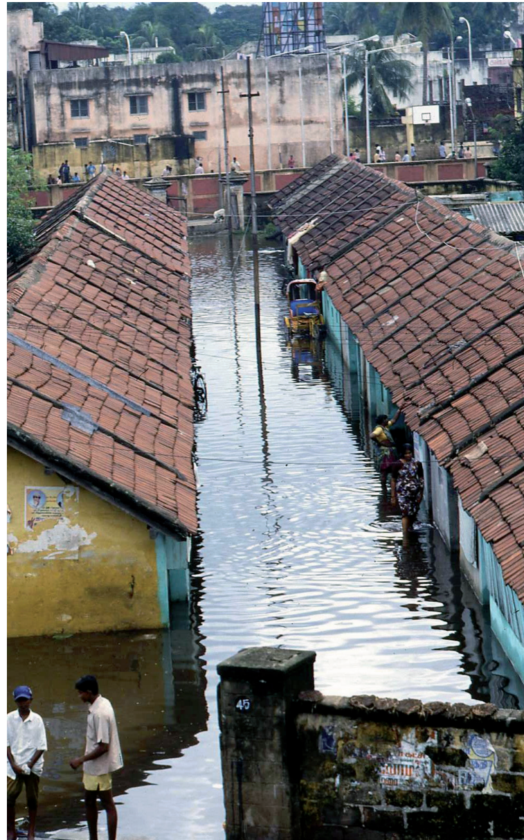
With most of Chennai, India being flat, floods can happen within six minutes from the start of a sustained burst of rain.