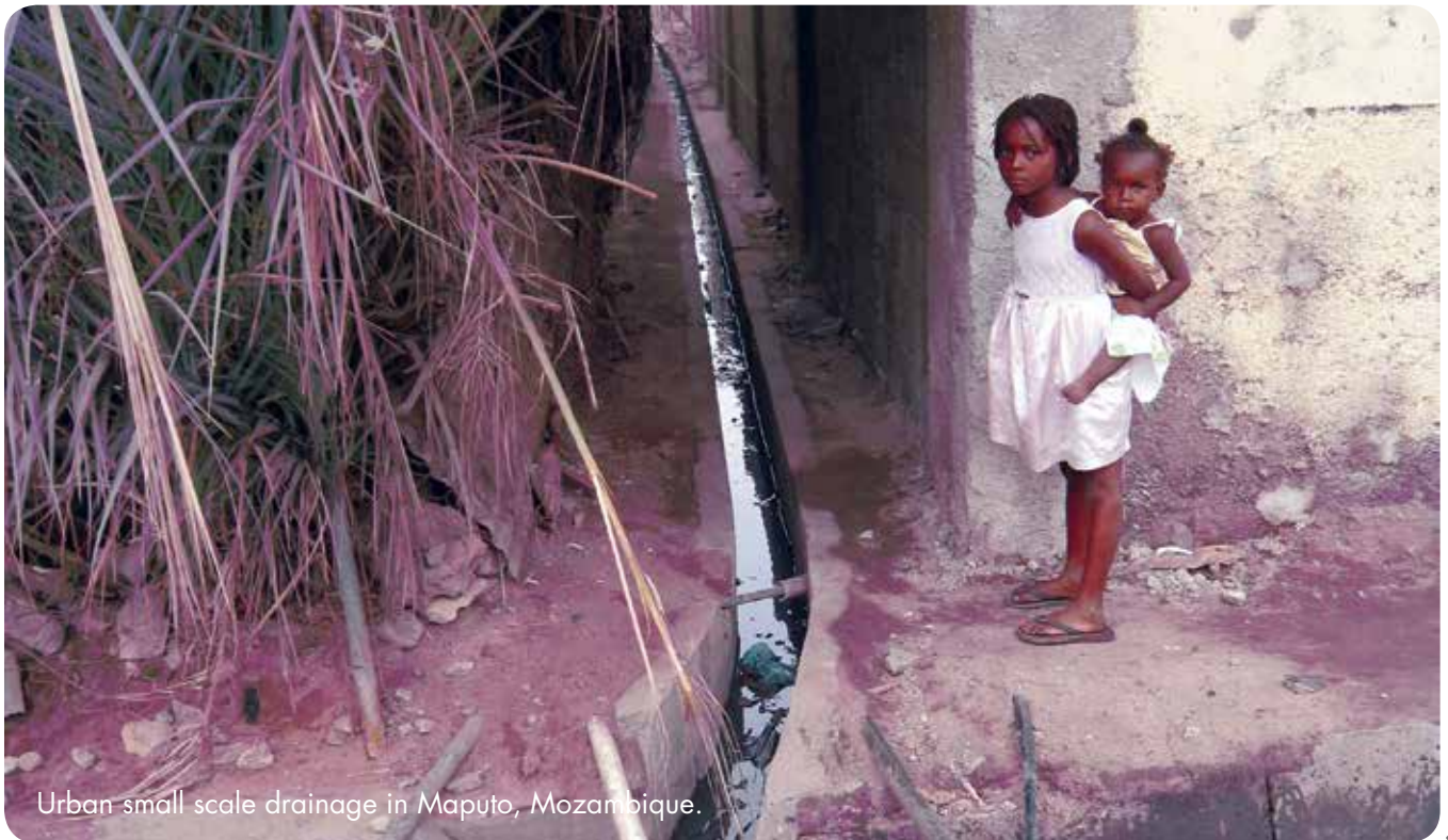
Urban small scale drainage in Maputo, Mozambique.